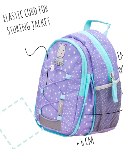
ENLARGE THE PACK WHENEVER YOU NEED MORE SPACE!