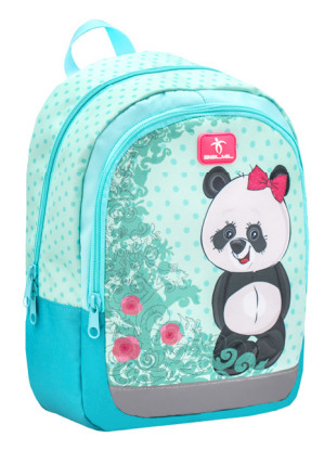
Panda ★ * * *