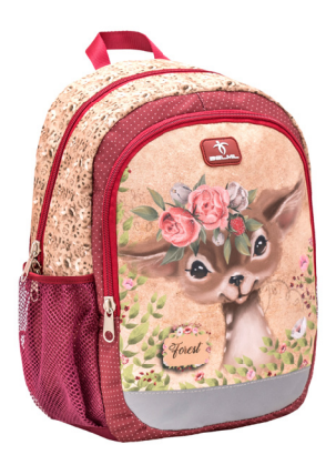
Animal Forest Bambi