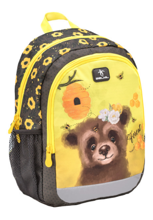
Animal Forest Bear