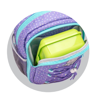
<sub>STORE WATERBOTTLE</sub> AND LUNCHBOX SAFELY