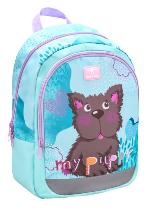
M Puppy ★ ★ ★ ★