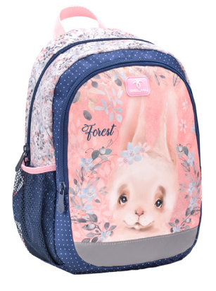
Animal Forest Bunny