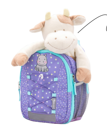
STORE YOUR ' FAVOURITE TOYS AND LITTLE BLANKETS