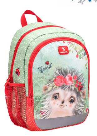
Animal Forest Hedgehog